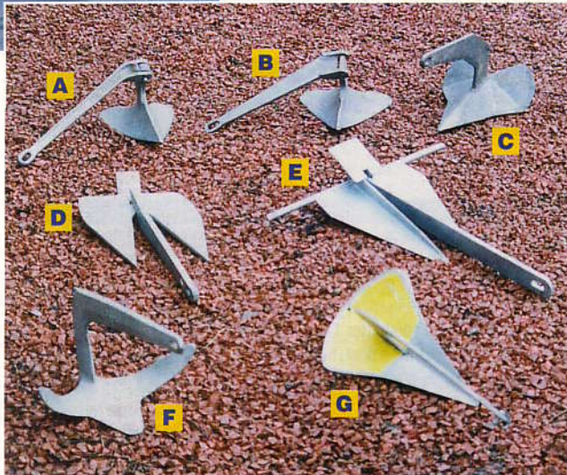
A CQR 10 lb – 4.8 kg, 480 sq cm; B HiBlade 10 lb – 4.7 kg, 510 sq cm; C Delta 6 kg – 6.7 kg, 620 sq cm; D Brittany 6 kg – 6.2 kg, 560 sq cm; E Danforth 6 kg – 6.2 kg, 610 sq cm; F Bruce 5 kg – 4.9 kg, 300 sq cm; G SPADE 6.5 – 5.1 kg, 460 sq cm